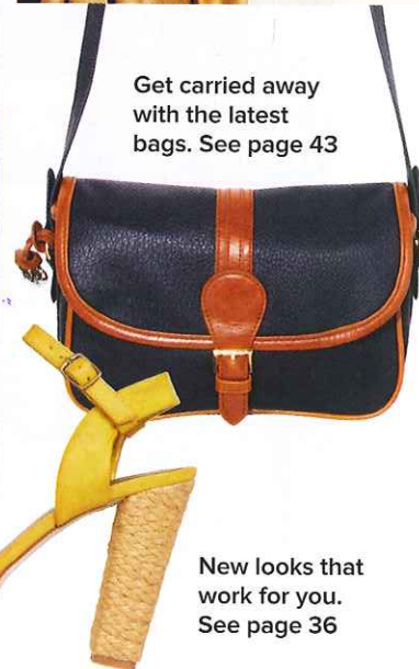
Get carried away with the latest bags. See page 43