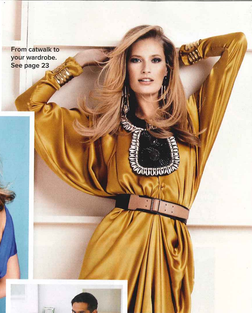
From catwalk to your wardrobe. See page 23